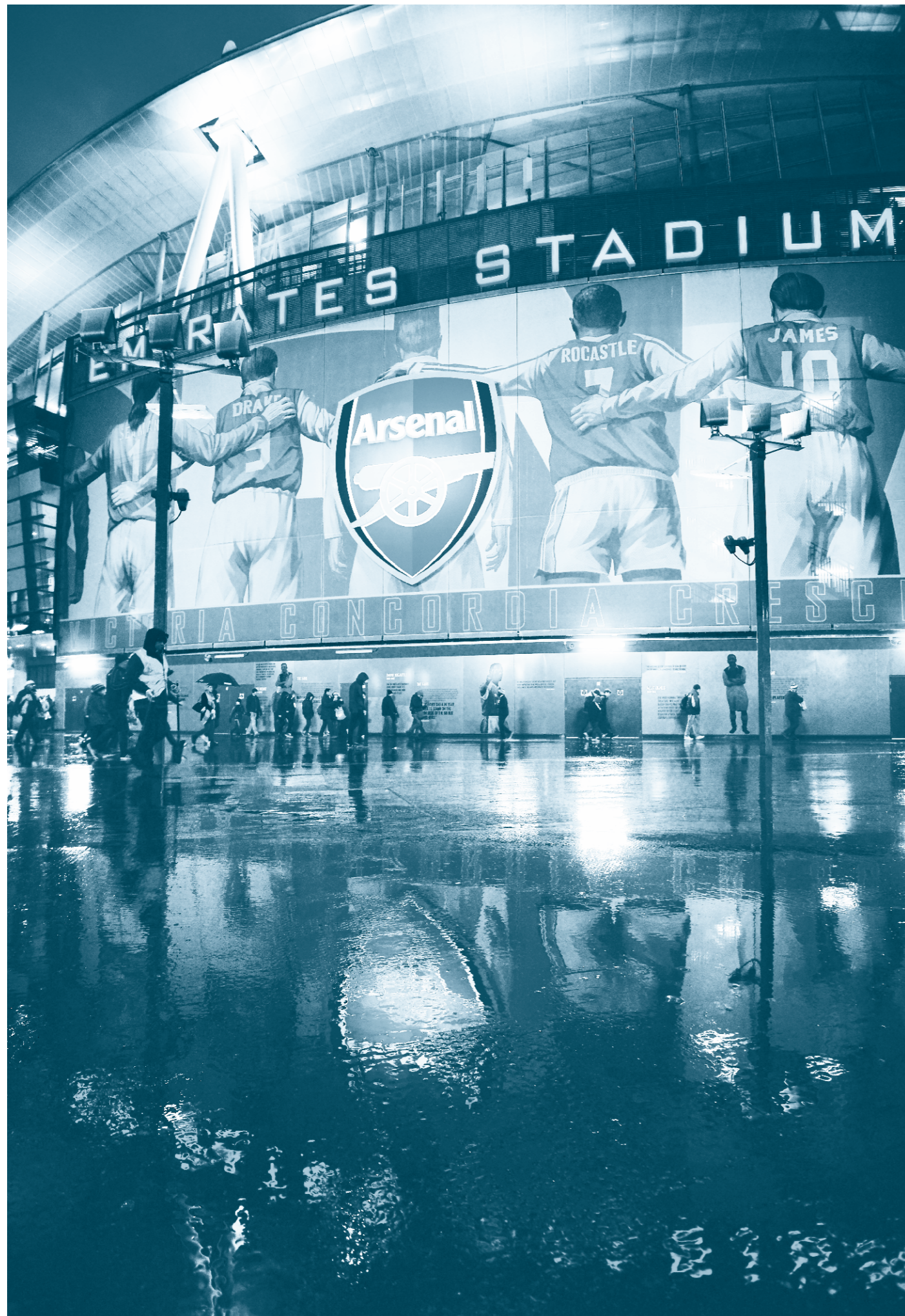
Spectators walk outside the stadium ahead of the English Premier League football match between Arsenal and Queens Park Rangers at the Emirates Stadium in London on December 26, 2014.

even further back, 80 years before the Battle of Sedan, when the world was astonished to witness the overthrow of monarchy and aristocracy by the French Revolution.