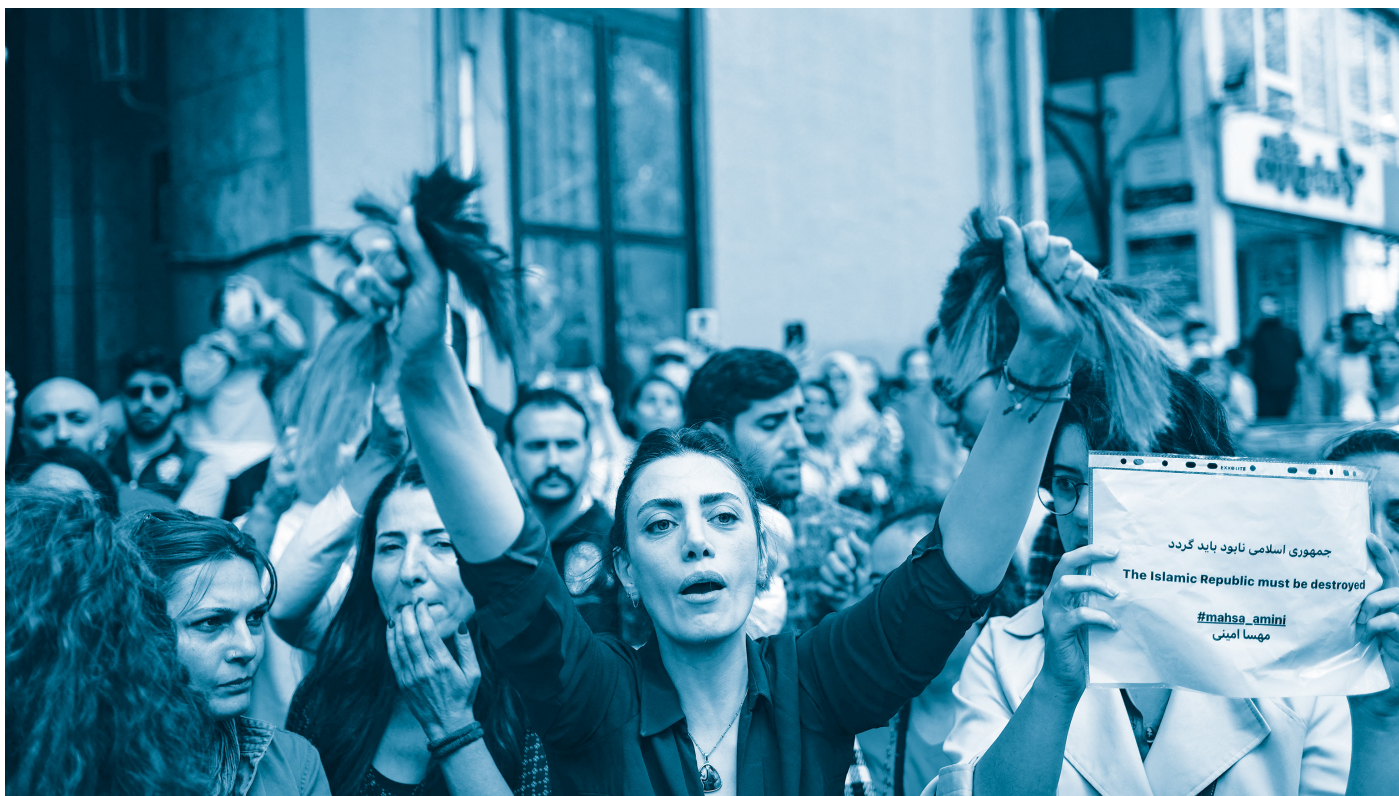
Iranian women hold up their hair after cutting it off with a pair of scissors during a protest outside the Iranian consulate in Istanbul. This demonstration follows the death of an Iranian woman after her arrest by the country's morality police in Tehran.

nations 14 . Existing sanctions have already severely restricted Iran's trade and foreign-investment prospects, further isolating the country from the global financial system.